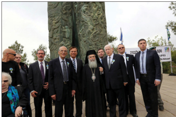
Holocaust Martyr's and Heroes' Remembrance Day ceremony at Martyrs' Forest "Scroll of Fire" Plaza in Jerusalem

Our World Center in Jerusalem keeps us well connected to events and leaders in Israel. From the top echelons of the Knesset, the World Center has the contacts needed for this work.